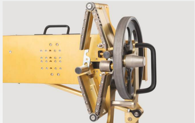
Measurement probes of MessReg CDM