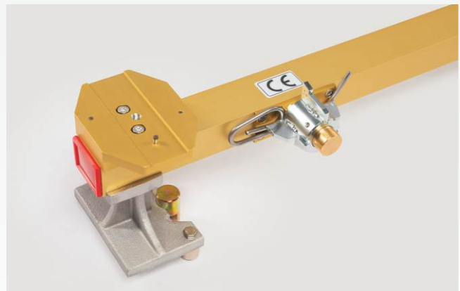
Attachment for wide measurement bases