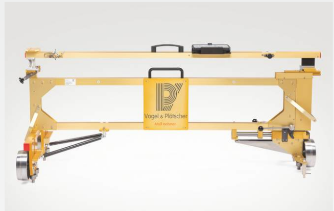
MessReg PTP II on „WeichenCaddy“