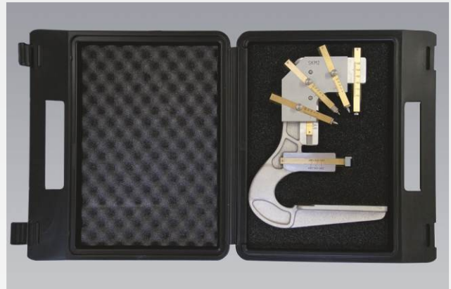
SKM 2 in its transport case