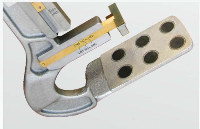
Rail foot contact plate with magnetic supports