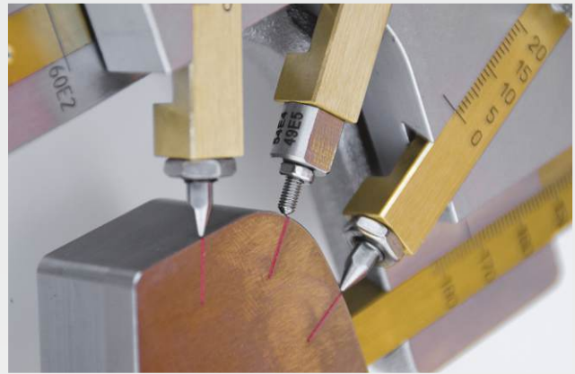
SKM 2: Measuring the wear of the running edge at three reference points