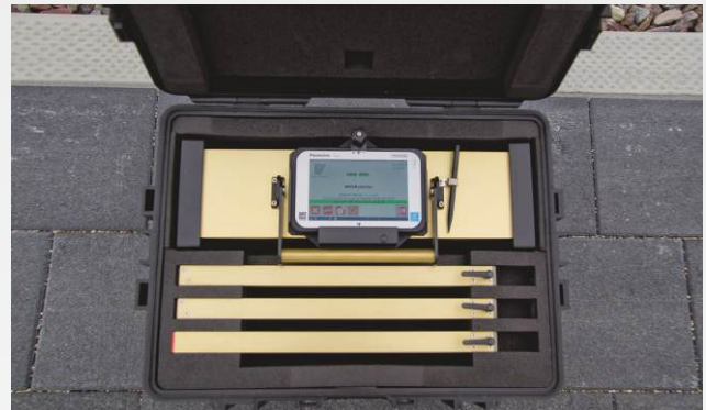
RM 150HR in its transport case