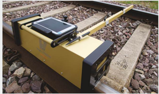
RM 150HR with modular support arm