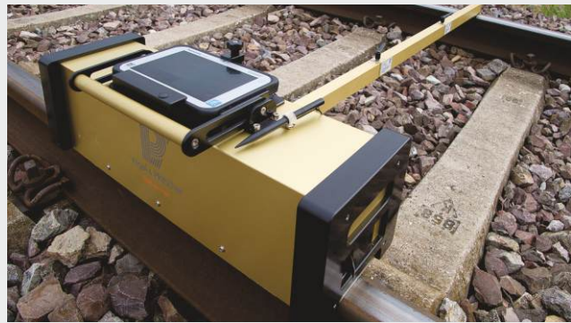
RM 150HR with modular support arm