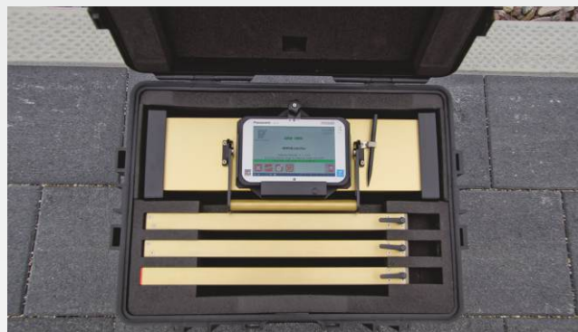
RM 150HR in its transport case