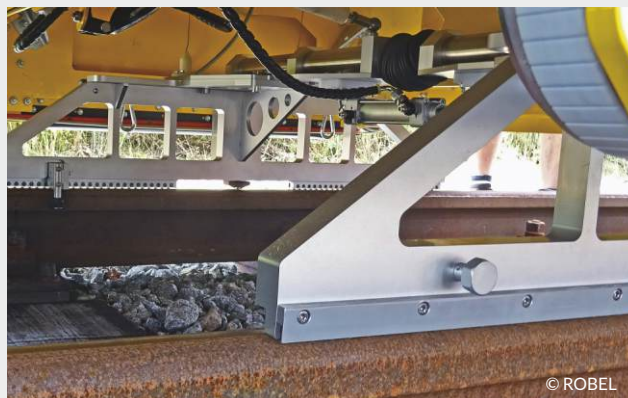
RMF 1100 integrated in reprofiling machine

*All figures based on a nominal gauge of 1435 mm. Details for other gauges available on request.