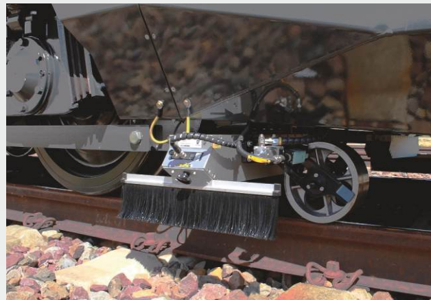
Integrated laser-based transverse profile measuring system