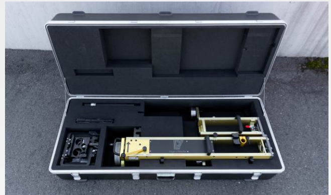
MessReg CTS II in its transport case