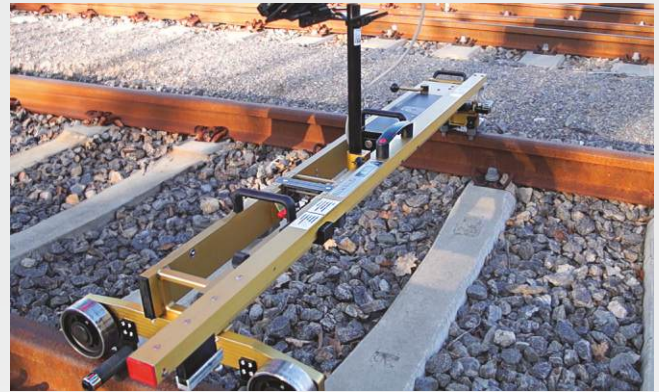
MessReg CTS II with mounting for manual switch gauge

* All figures based on a nominal gauge of 1435 mm. Details for other gauges available on request.